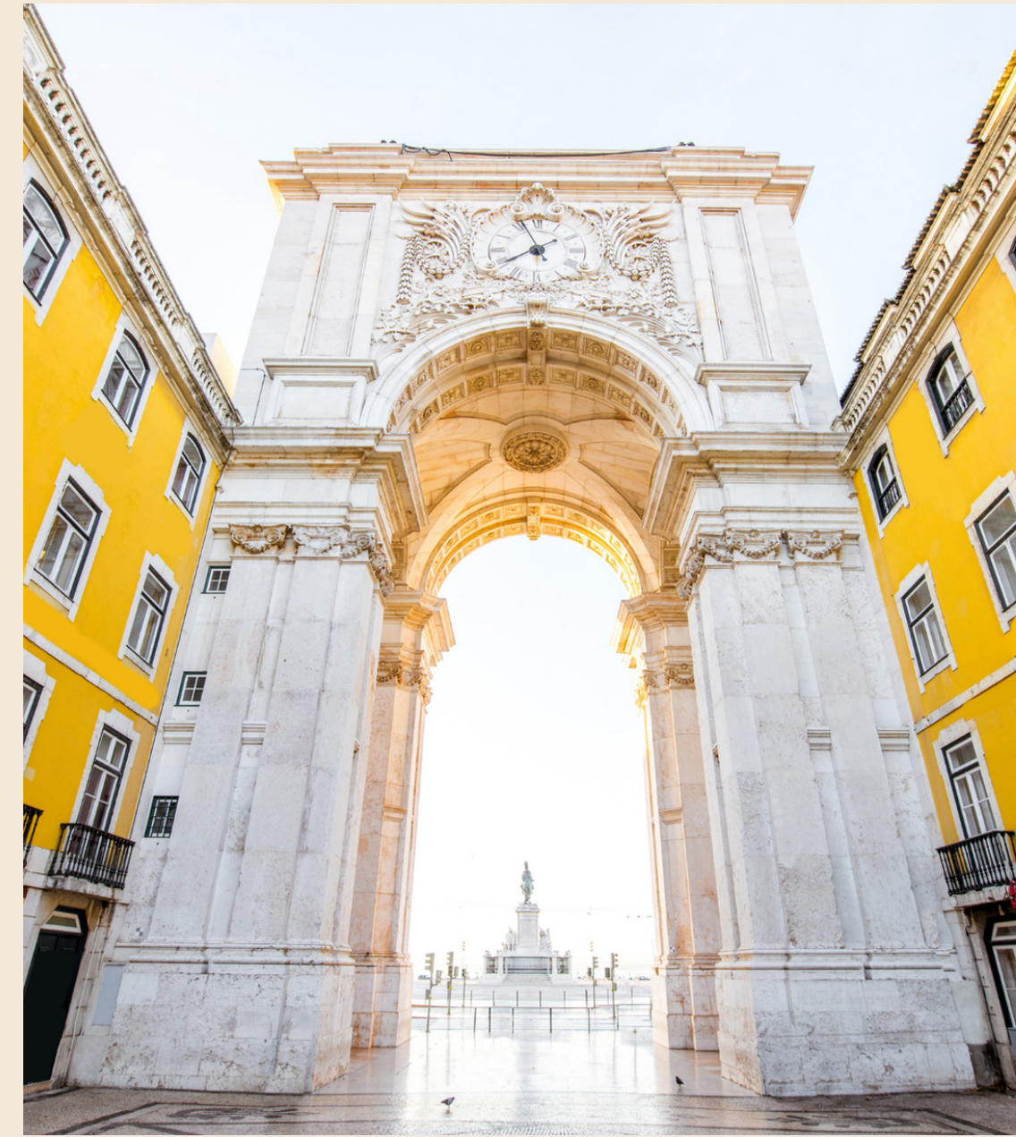
Central Connectivity – Walkable to all major attractions and transport.