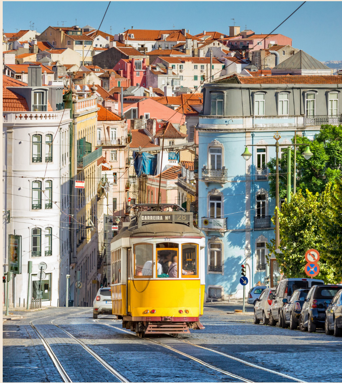
Historic Architecture – UNESCO heritage atmosphere.